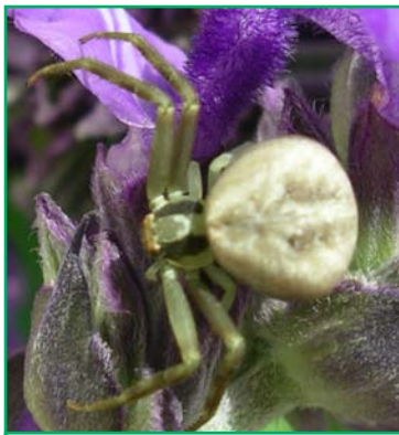
Figure 8. Crab spider on a flower.

Crab spiders, in the family Thomisidae, are common on leaves and flowers (Fig. 8), and some species are found on the ground. These