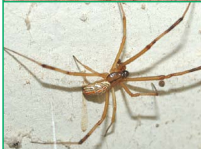
Figure 10. Female widow spider (top), male widow (bottom).

piles, garages, cellars, shrubbery, crawl spaces, rain spouts, termite bait stations, gas and electric meters, and other rarely disturbed places.