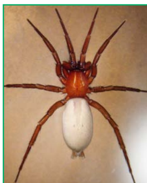
Figure 1. Ground spider showing cephalothorax, abdomen and eight legs.

The spinnerets and a distinct abdomen distinguish spiders from the other arachnids.