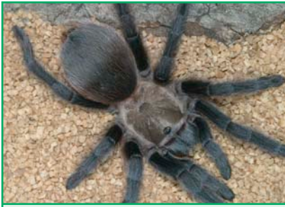
Figure 2. Tarantula, Aphonopelma .

are sometimes lined with silk webbing and are covered with a thin silk curtain. In the winter or the hottest months of summer, these burrows