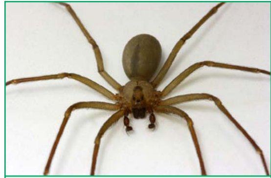
Figure 9. Recluse spiders have six eyes arranged in three pairs.

Recluse spiders are most active at night but can occasionally be seen during the day. They actively hunt insects and other arthropods and do not use a web to trap their prey. Their web is used mostly as a