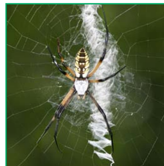
Figure 5. Argiope spider in a web.

In recent years, long-jawed orbweavers in the genus Tetragnatha have built large communal webs. These “super webs” are unusual and have most commonly been found near water, especially where there food sources like midges or other