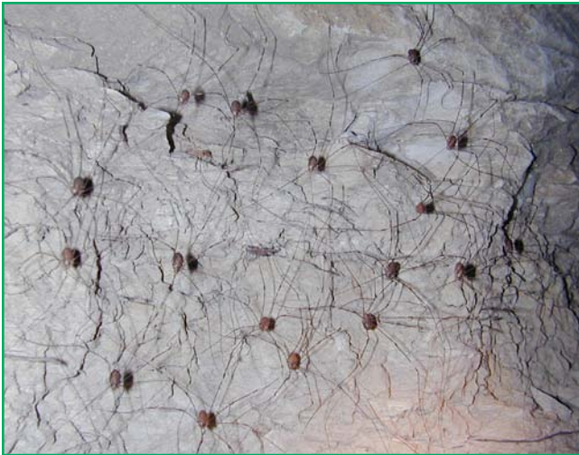
Figure 11. Harvestmen are sometimes seen in colonies, where they may bounce up and down together.