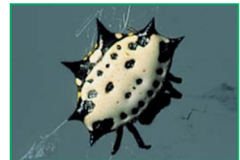
Figure 6. Spinybacked orbweavers are common in wooded areas.