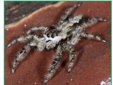
Figure 3. Adult jumping spider.

Hundreds to thousands of wolf spiders may live in the average backyard lawn, where they feed on insects and small organisms. Although they may be a nuisance, they can control other pests. Because they are so plentiful, wolf spiders commonly enter homes under gaps in doorways. Although some wolf spiders can be aggressive if handled improperly, they are generally not dangerous to people or pets and can usually be picked up with bare hands or