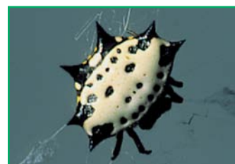
Figure 6. Spinybacked orbweavers are common in wooded areas.