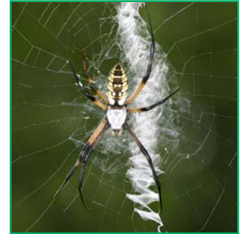
Figure 5. Argiope spider in a web.

In recent years, long-jawed orbweavers in the genus Tetragnatha have built large communal webs. These “super webs” are unusual and have most commonly been found near water, especially where there food sources like midges or other