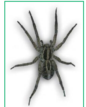
Figure 4. Wolf spider, Schizocosa spp.