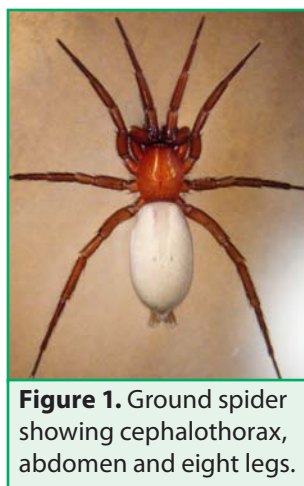
Figure 1. Ground spider showing cephalothorax, abdomen and eight legs.

The spinnerets and a distinct abdomen distinguish spiders from the other arachnids.